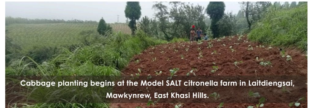
Cabbage planting begins at the Model SALT citronella farm in Laitdiengsai, Mawkyrnrew, East Khasi Hills.

To promote rural livelihoods, 54 piglets were distributed to six SHGs under Chak Nari IVCS in Belguri, Tikrikilla Block, West Garo Hills. The initiative supports women-led income generation through cooperative pig rearing, fostering entrepreneurship, group cohesion, and sustainable livestock farming.